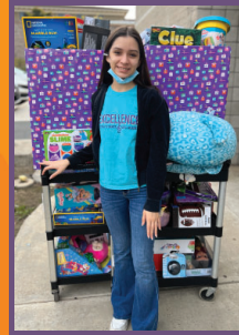
Christmas Toy Drive