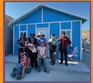
Tijuana Home Build