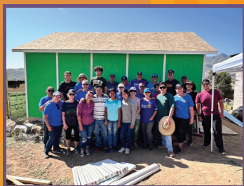
Tijuana Home Build