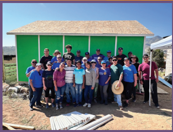
Tijuana Home Build